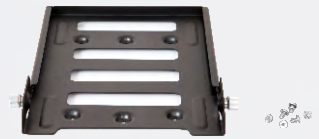
Multi-Functional Installation Bracket BRK17

Optional antenna designed by Hytera is highly recommended. *Outdoor use of RD96X with antenna should avoid thunderstorms.