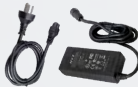
Power Adapter for Portable Repeater PS7502