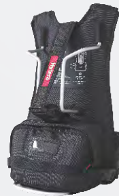
Nylon Backpack (for portable repeater only)(black) NCN010