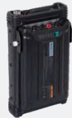
Power Management System PV3001