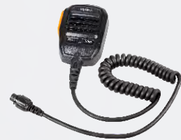
Waterproof Remote Speaker Microphone (IP67) SM18A1

Optional antenna designed by Hytera is highly recommended. *Outdoor use of RD96X with antenna should avoid thunderstorms.