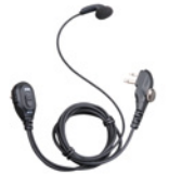
Earbud With on-Mic PTT & VOX ESM12