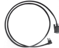
Programming Cable (COM Port) PC19