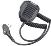
Remote Speaker Microphone SM08M3